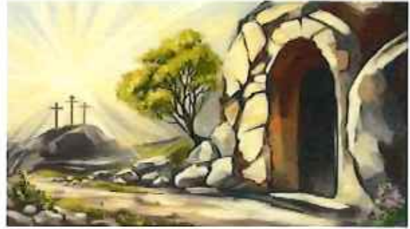
He Is Risen!!! Alleluia!!